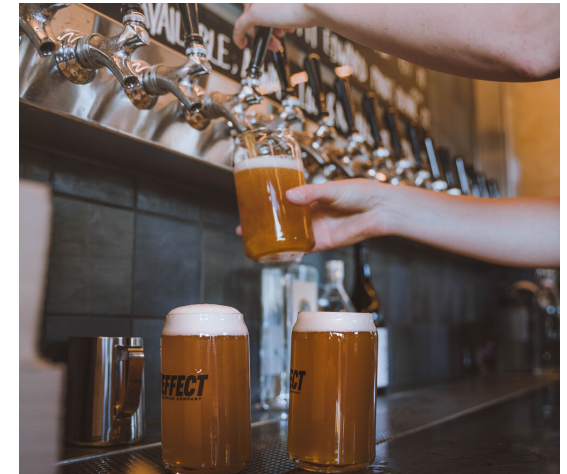
13 beer taps