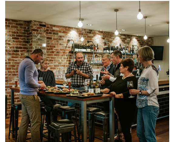
Range of seating options