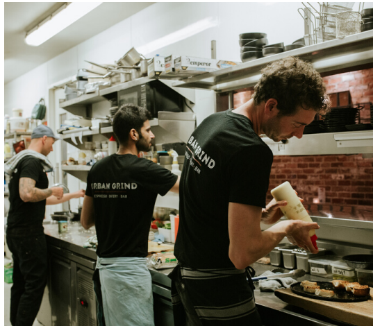
Experienced chef & kitchen