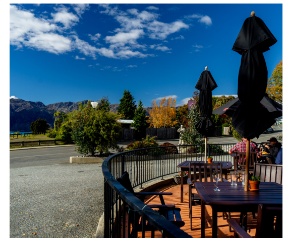
Range of seating options