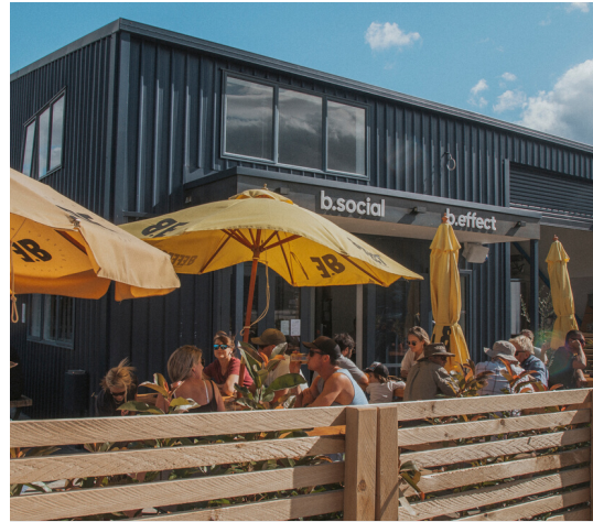
Outdoor beer garden