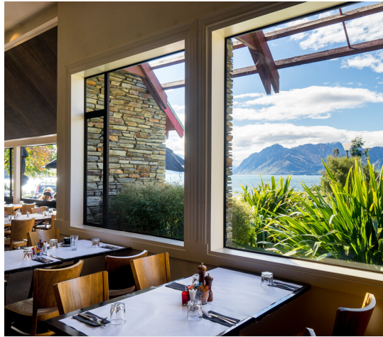
Experienced chef & kitchen