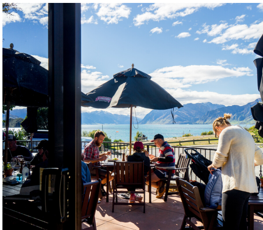
Restaurant & lounge