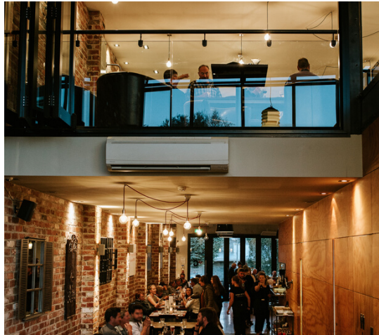
The Loft & restaurant